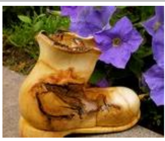
CREATIVE BOOT OR SHOE with ROMAN HRYTSAK