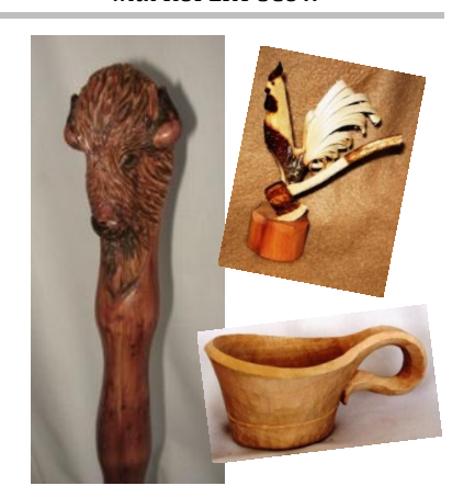
WALKING STICK & OTHER PROJECTS EACH DAY with RICK WIEBE