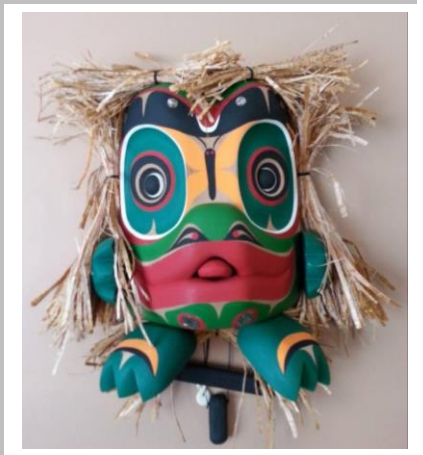
NWC NATIVE DANCING FROG with RUPERT SCOW