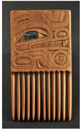
NWC NATIVE FORMLINE DESIGN with ROBERT BARRATT