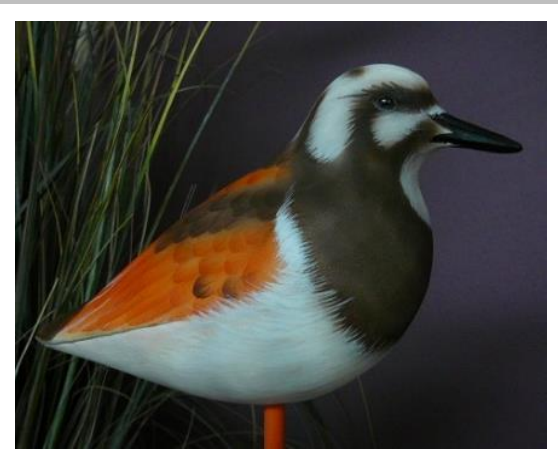
AIRBRUSHING - RUDDY TURNSTONE SMOOTHIE with BOB STEELE