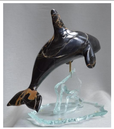
CARVE YOUR OWN DESIGN IN STONE with MICHAEL BINKLEY