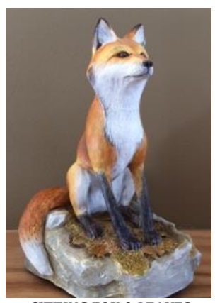
SITTING FOX & LEAVES with BRENDA MITCHELL