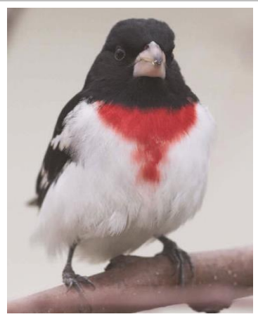
ROSE-BREASTED GROSBEAK with CAM MERKLE