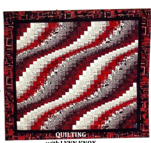
with LYNN KNOX